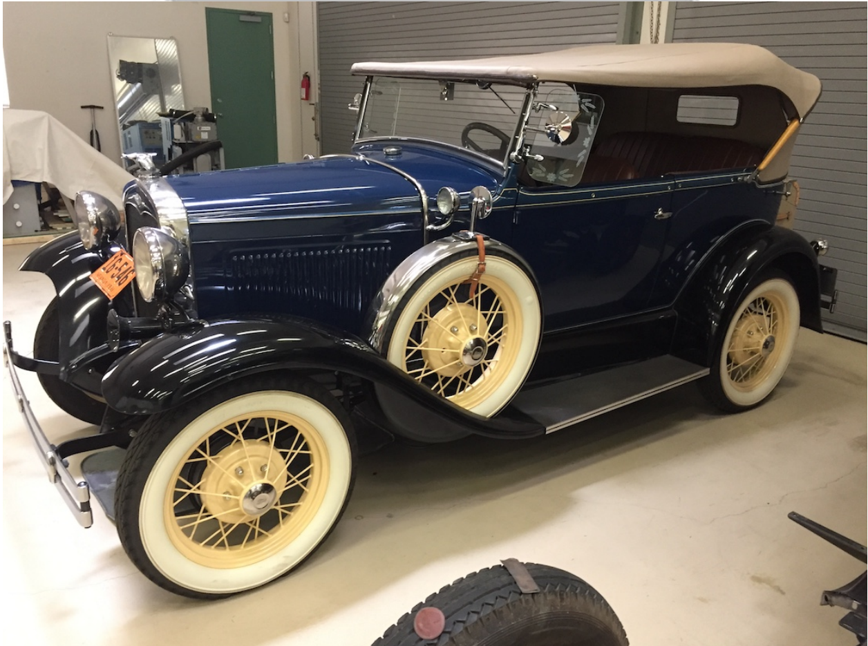
1931 Deluxe Phaeton

Willamette Valley Chapter P.O. Box 3031 Salem, OR 97302