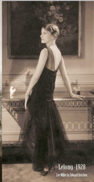
Lelong 1928 Lee Miller by Edward Steichen