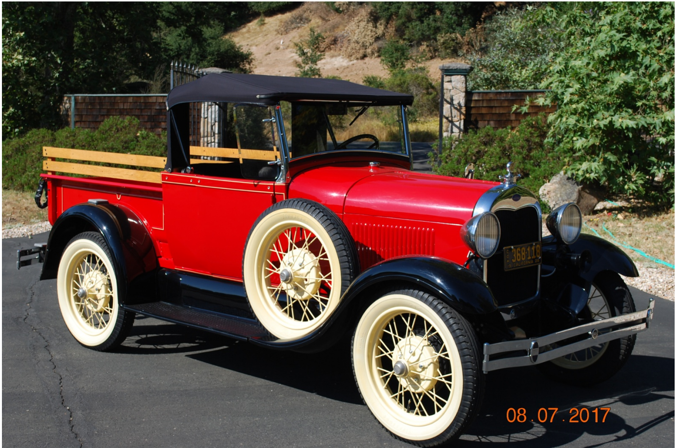
1928 Open Cab Pick-up

Willamette Valley Chapter P.O. Box 3031 Salem, OR 97302