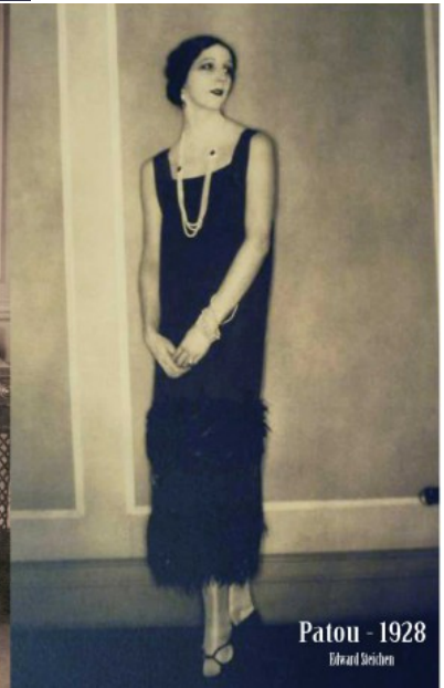
Patou - 1928 Edward Steichen